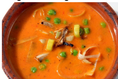
Spring Vegetable Soup

Small artichokes are good for pickling, stews and casseroles.; medium sized artichokes are good for salads; and large sized artichokes are good for stuffing or sautéing.