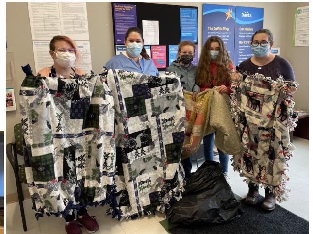
Deronda Diplomat members made and delivered tie blankets for dialysis patients at Davita Dialysis Clinic in Amery.

Cushing 4-H Club held their annual "Club Rush" at their April meeting. This event gives the opportunity for youth to teach their peers about a project they have worked on in the past, as well as giving members a chance to see what new projects they may be interested in trying. It was a lot of fun to see and hear all that 4-Hers have been working on, learning, and growing through their preparation to bring exhibits to the fair.